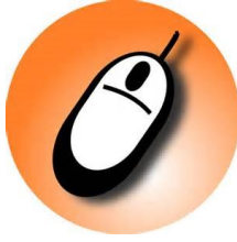
FRESH LOOK FOR THE FUTURE