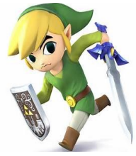
PARDON THE PUN