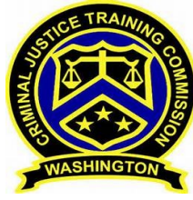
CONGRATS GRADS OF MPA 1052-1